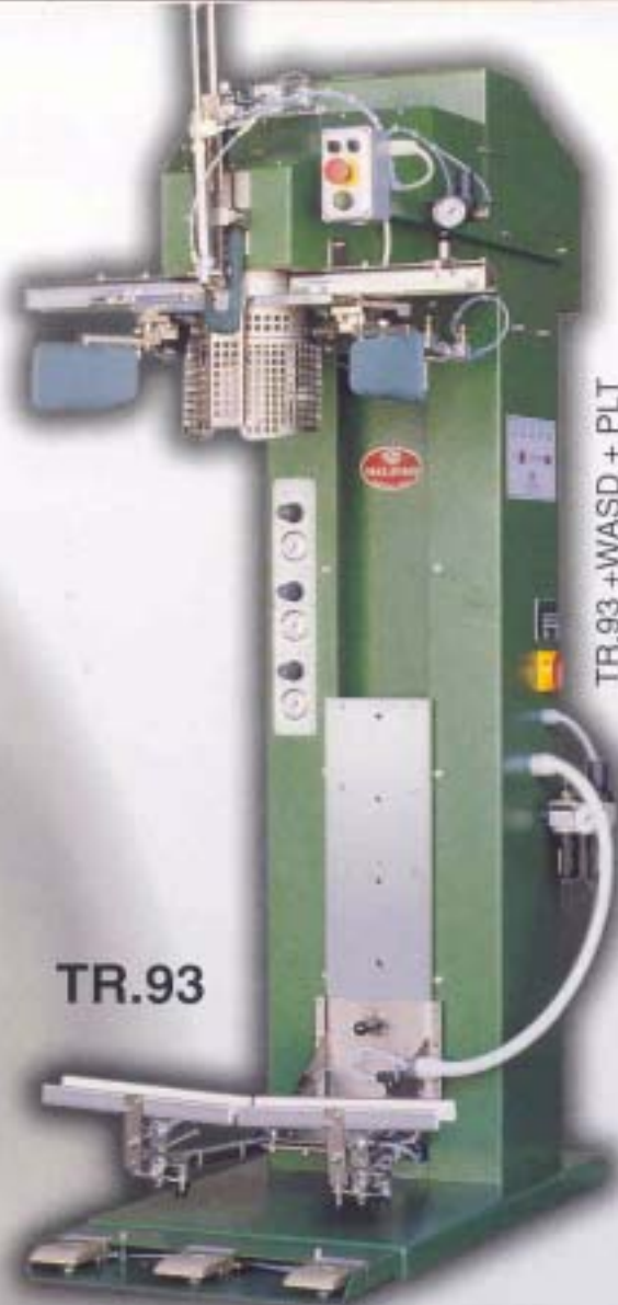
TR.93 +WASD + PLT